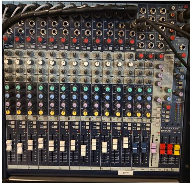
Sound System in Meeting Room K